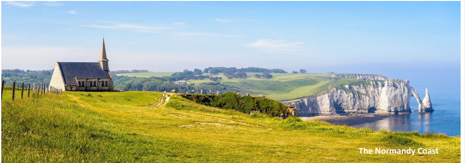
The Normandy Coast

Day 1 Depart the USA Begin your thrilling journey as you depart from the USA on an overnight flight to the enchanting city of Paris, France. Enjoy meals & beverages onboard.