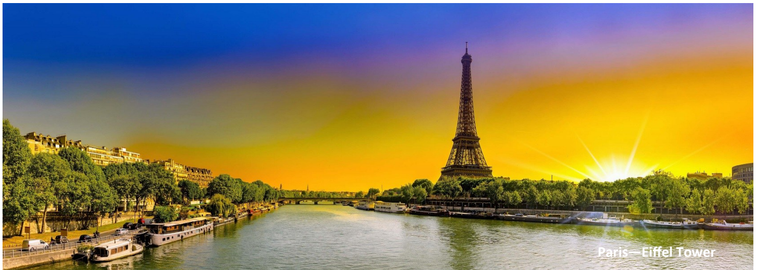
Paris – Eiffel Tower

Day 6 Caen - Reims After breakfast at your hotel, bid farewell to Caen & transfer to the splendid city of Reims. Stop in the historic town of Rouen, renowned for its half-timbered buildings & breathtaking gothic cathedral. Continue your journey to Reims, nestled in the spectacular Champagne region. (B)