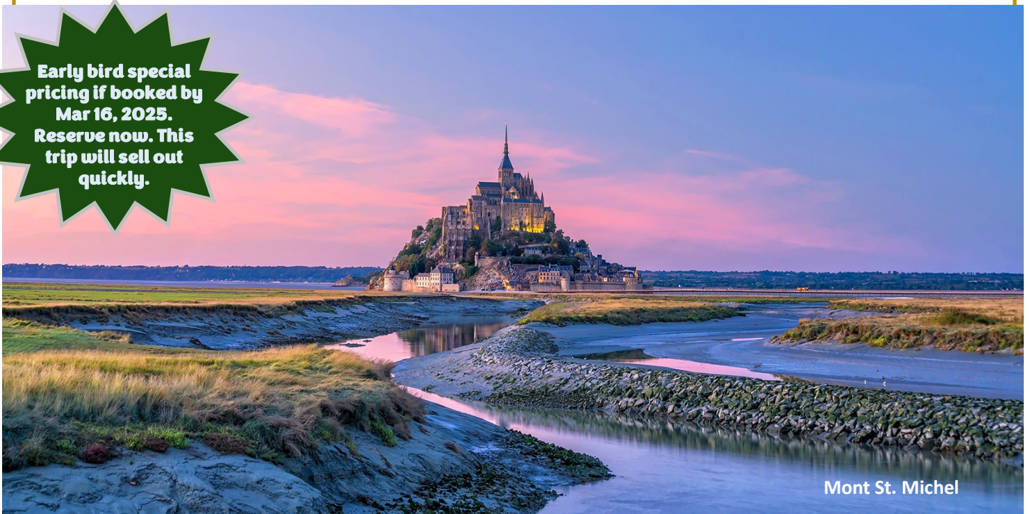
Mont St. Michel

Early bird special pricing if booked by Mar 16, 2025. Reserve now. This trip will sell out quickly.