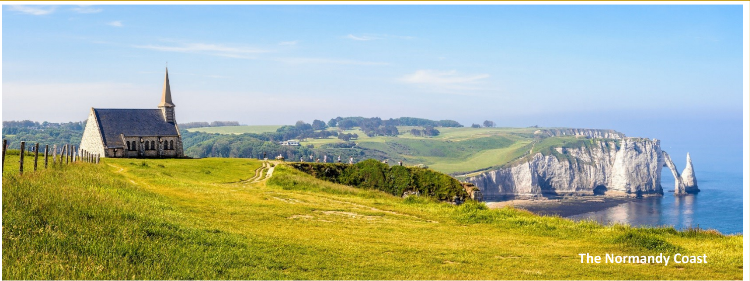
The Normandy Coast

Day 1 Depart the USA Begin your thrilling journey as you depart from the USA on an overnight flight to the enchanting city of Paris, France. Enjoy meals and beverages onboard.