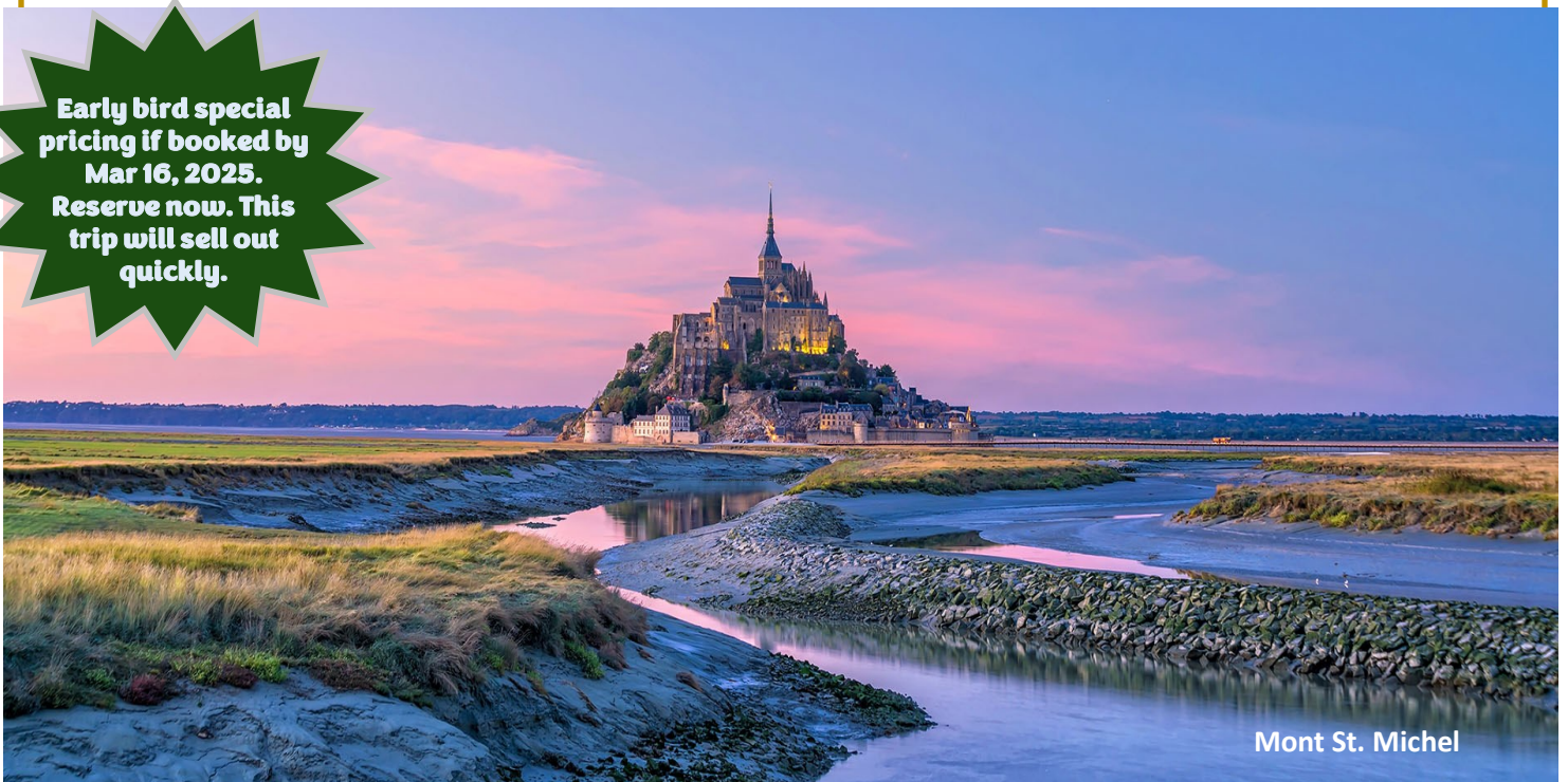
Mont St. Michel

Early bird special pricing if booked by Mar 16, 2025. Reserve now. This trip will sell out quickly.