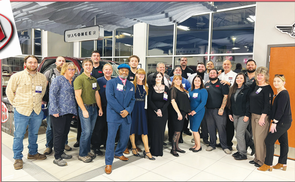
Our Mixer Host Tasca Chrysler, Jeep, Dodge, Ram, Fiat of Kingston staff.