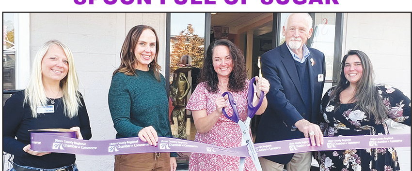
1014 Morton Blvd., Kingston NY