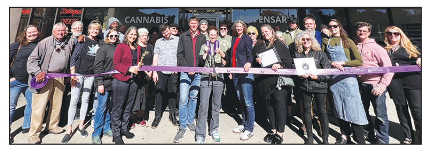
308 Plaza Road, Kingston NY catskillmtnhigh.com