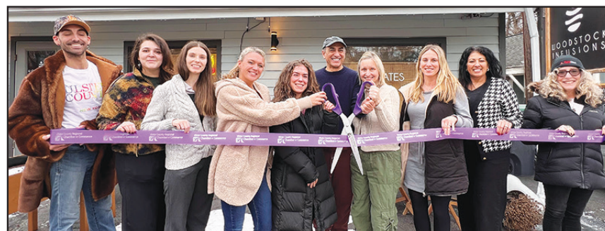
104 Mill Hill Road, Woodstock, NY www.woodstockinfusions.com