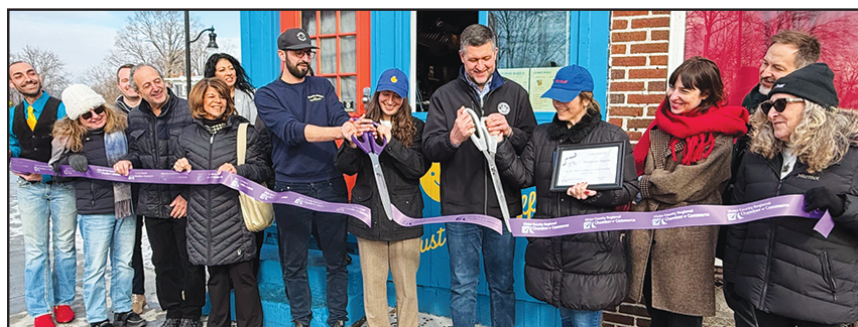
746 Broadway, Kingston, NY www.moonrisebagels.com