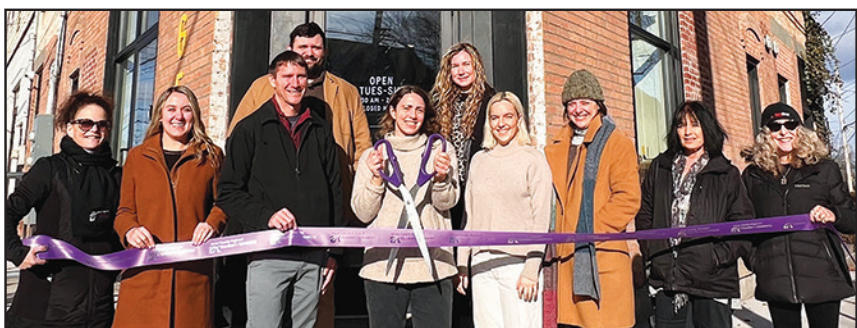
392 Hasbrouck Avenue, Kingston, NY fantzye.com