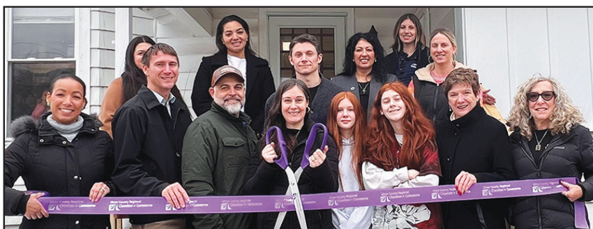
402 Albany Avenue, Kingston, NY www.playhavenny.com